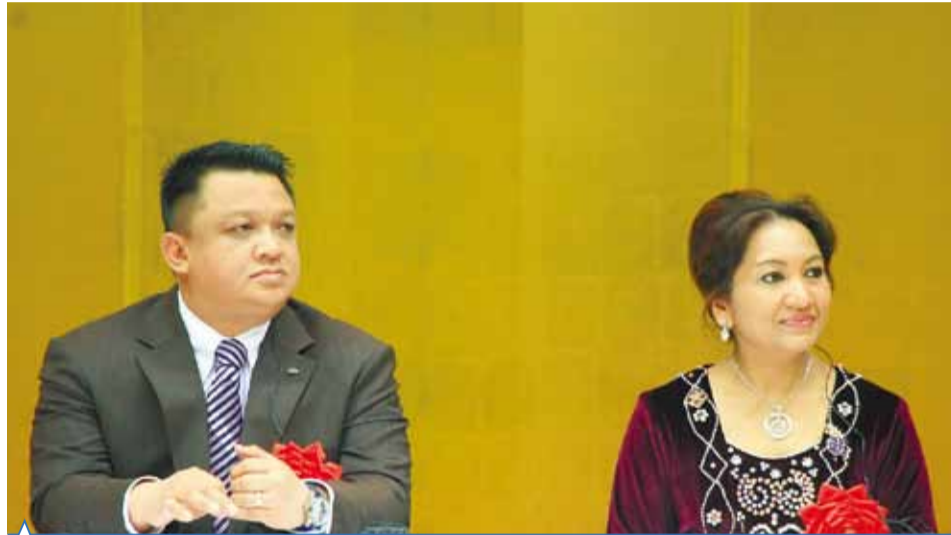
Right photo: The Crown Prince of Perlis, Malaysia, HRH Tuanku Syed Faizuddin Putra Ibni Tuanku Syed Sirajuddin Jamalullail, one of the guests at the JIU entrance ceremony, addresses new students at the Togane Campus in Chiba Prefecture on April 2; Left photo: The Crown Prince and Crown Princess of Perlis, Malaysia, HRH Tuanku Hajjah Lailatul Shahreen Akshah Binti Khalil, look on during the ceremony.