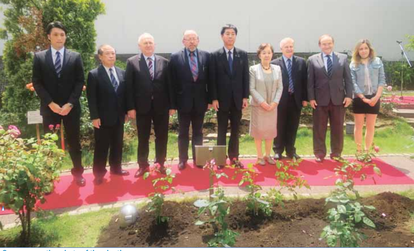
Commemorative photo of the planting ceremony