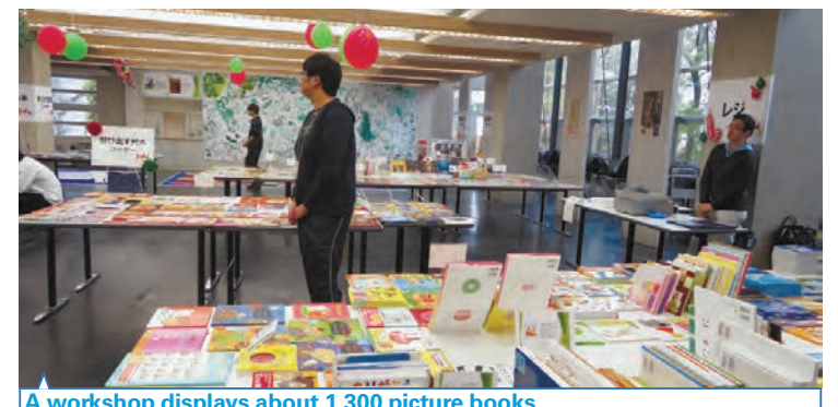
A workshop displays about 1,300 picture books.

A workshop displaying about 1,300 picture books was also held. Additionally, visitors were able to enjoy music and dance performances on campus.