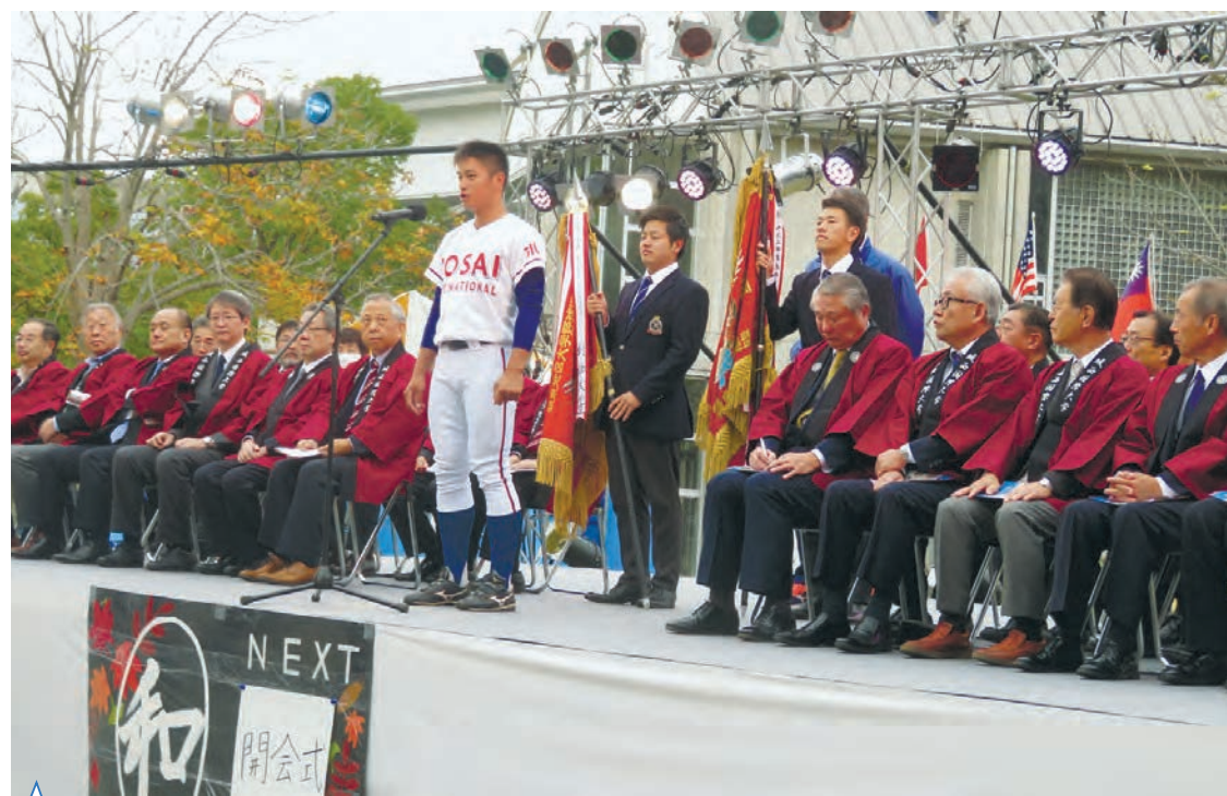
The baseball team was applauded for its achievement.