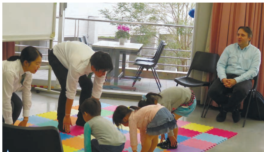
Students teach English at a classroom.