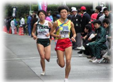
Woman Ekiden Club