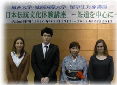
Experience Japanese traditional culture, "Sado" (Tea ceremony)