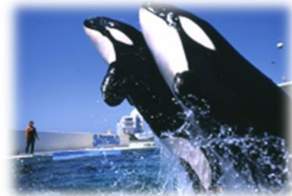
Kamogawa Sea World