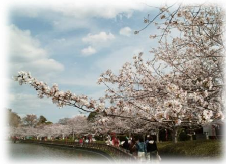
Hakkaku Lake's cherry tree