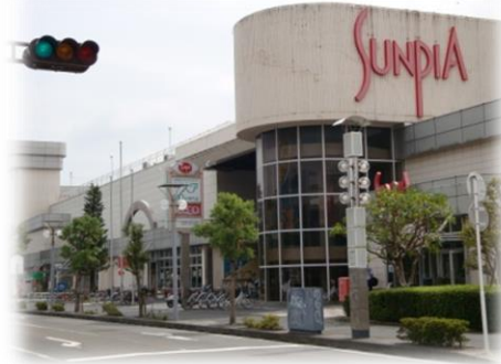
SUNPIA (Togane city's Shopping Mall)

The city of Togane, where JIU is located, is approximately 50km from central Tokyo. With a population of around 60,000, this modern city is known for its winter strawberry cultivation through a network of greenhouses around the city. Historically, Togane can trace its origins back to the beginning of the 17 th century (Edo era) when it was a staging point and acted as an inn town on a main road, or highway, which has become the backbone of the city's modern development. This highway known as the Onari Kaido was built by orders of the first Shogun of the Tokugawa Shogunate, Ieyasu Tokugawa, who used it primarily for hunting trips. Under his order 350 years ago some 39 cedar trees were planted in Togane, and even today these trees can still be enjoyed as a reminder of the city's important historic role.