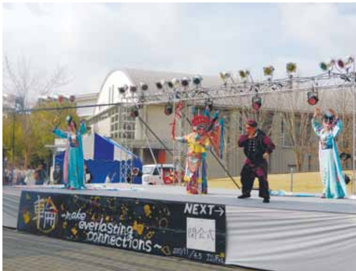
Top: The school Festival was held at Togane Campus on Nov. 4 and 5. "Make everlasting connections" is the theme; Bottom left: A picture book workshop; Bottom right: Beijing opera performance by Shenyang Normal University students